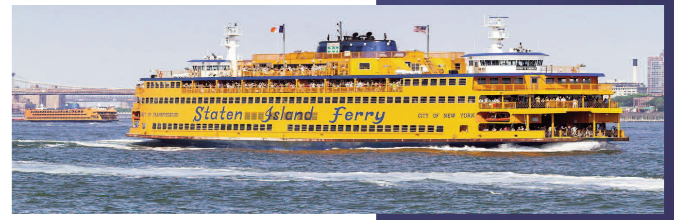
New York City Staten Island Ferry, Spirit of America, equipped with Thordon Water Quality Package and COMPAC seawater lubricated propeller shaft bearings.